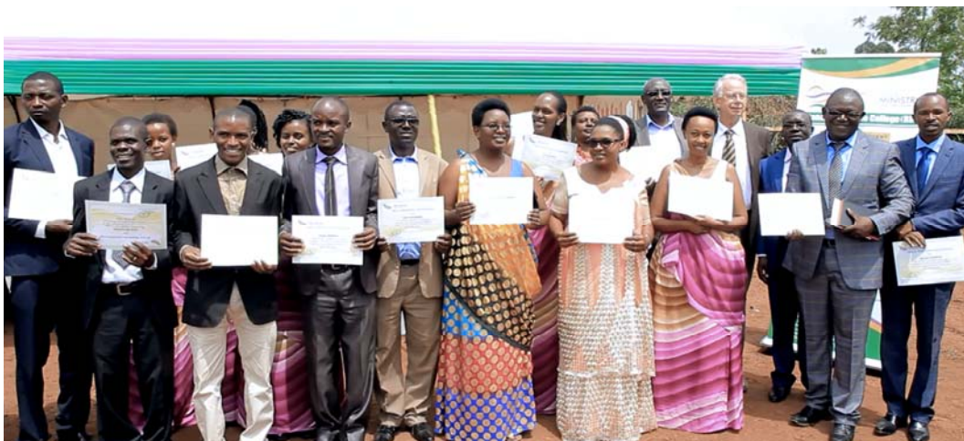
Everyone who has worked in our Kigali office over the past 10 years was honored with a certificate and thanked for their contribution.