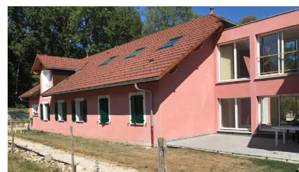
Back looking from where the buildings connect