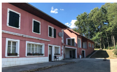
Front from the dining room area looking towards new wing