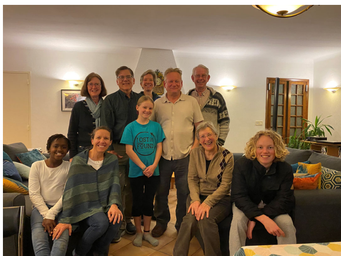
The team by the end of the year