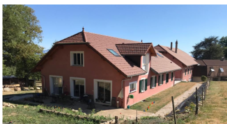
Back of new wing looking toward older building. Both apartments are on the ground level with the Meeting room upstairs